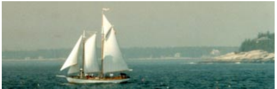
A fine looking traditional sailing vessel plying the waters of the Maine coast