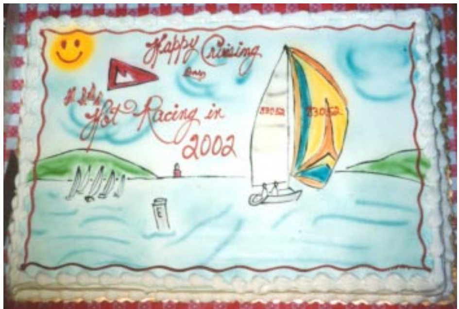
The 2002 version of the Cruise Planning Party "Traditional" Cake. Shortly before being devoured by members.