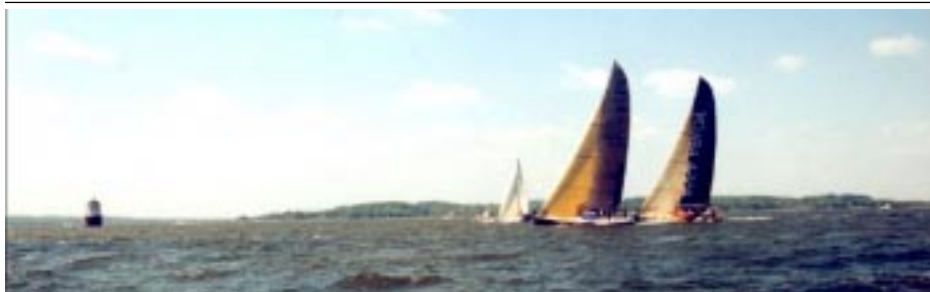
Volvo Ocean Race V60's On Parade From Baltimore to Annapolis