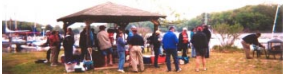
Sockburners Assembled at the Looper Waterfront Pavilion