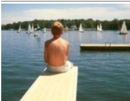
Missed the Boats!