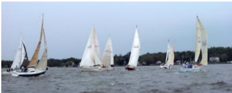
Magothy River Wednesday Night Races - "B" Fleet