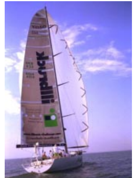
NEWS CORPORATION and ILLBRUCK at the Annapolis Restart of the Volvo Ocean Race

Correction: The photo of RAVENOUS on page 6 of the My Old Man was also taken by Kathy Polk, not Peggy Poe as reported. ed.