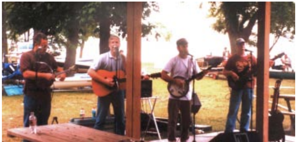
Bluegrass entertainment, courtesy of the Corsica River Yacht Club