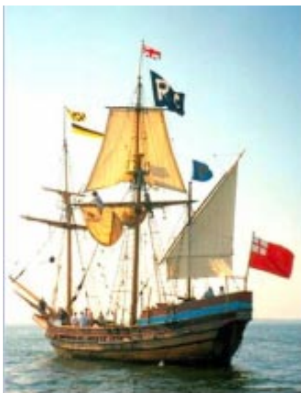
The ARK replica at the Governor's Cup