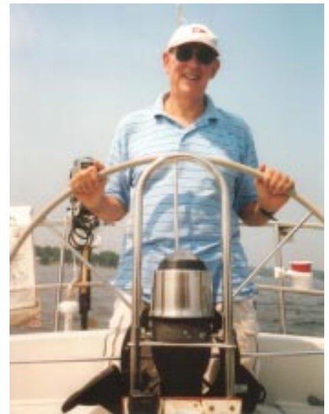
Trust Cap’n Neisner to have only the finest merchandise at the lowest cost

As resupply of merchandise is done with a single purchase, the best time to be sure that all the sizes that you need are available is to shop early. Remember that only a small markup from cost is made to cover losses and avoid losing money, so you get a bargain besides!