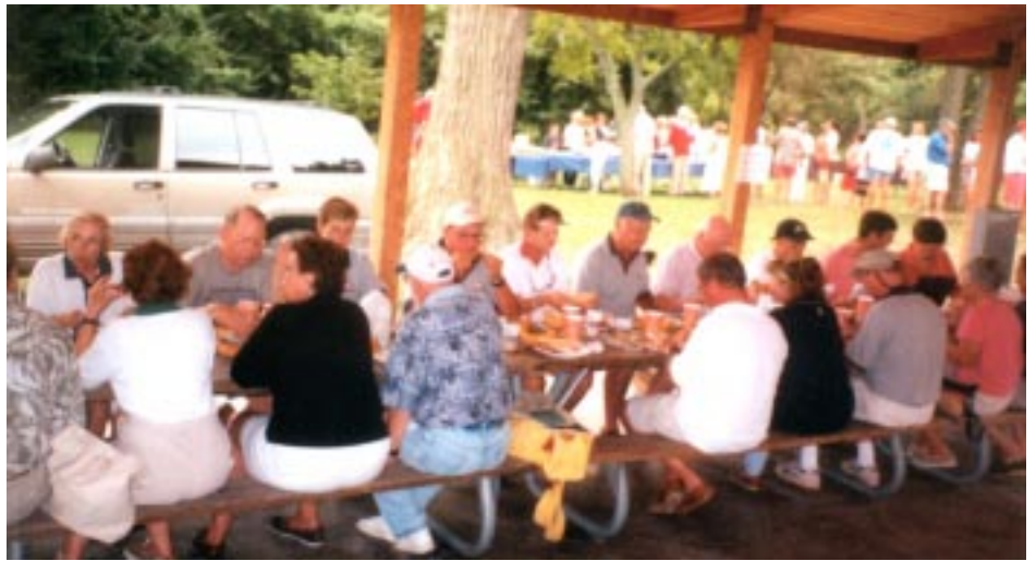
The MRSA mob munching down the fine food at the Corsica River picnic.