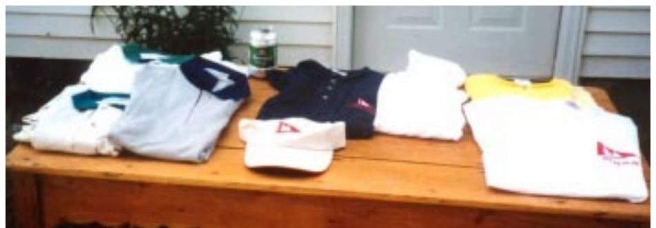
Get your gifts and clothing early, while the selection is the best !