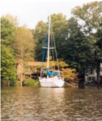
Elan floats above the pier the day after Isabel