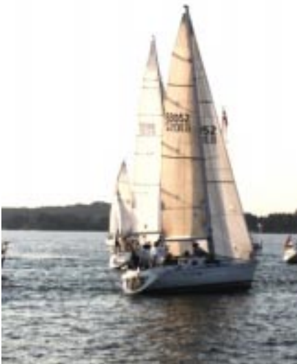
Incommunicado ahead of Boreas