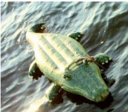
Behind the Committee Boat awaits the Fate of the Loser!