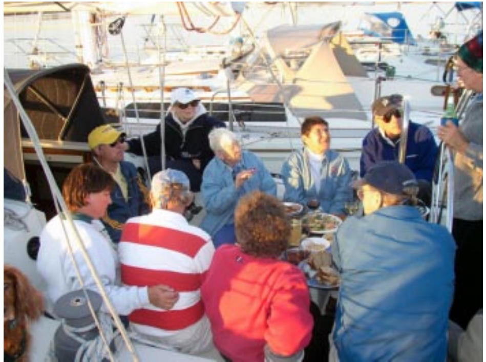
Have We Reached Stage 3 Yet??