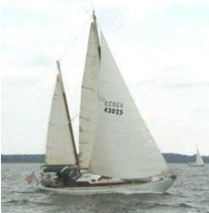
"CORRECTION " Last Month's Photo of Vanir