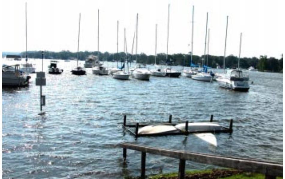
A Little Extra Water from Isabel . Looking at Cornfield Creek from Mir Bur Community Park and at the Mil Bur Marina. Lots of Boats.... No Piers!