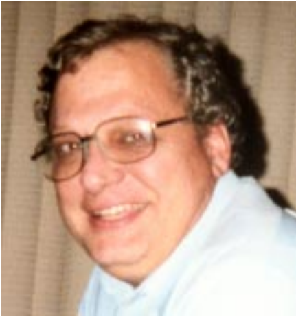
Commodore Alan Kirkendall