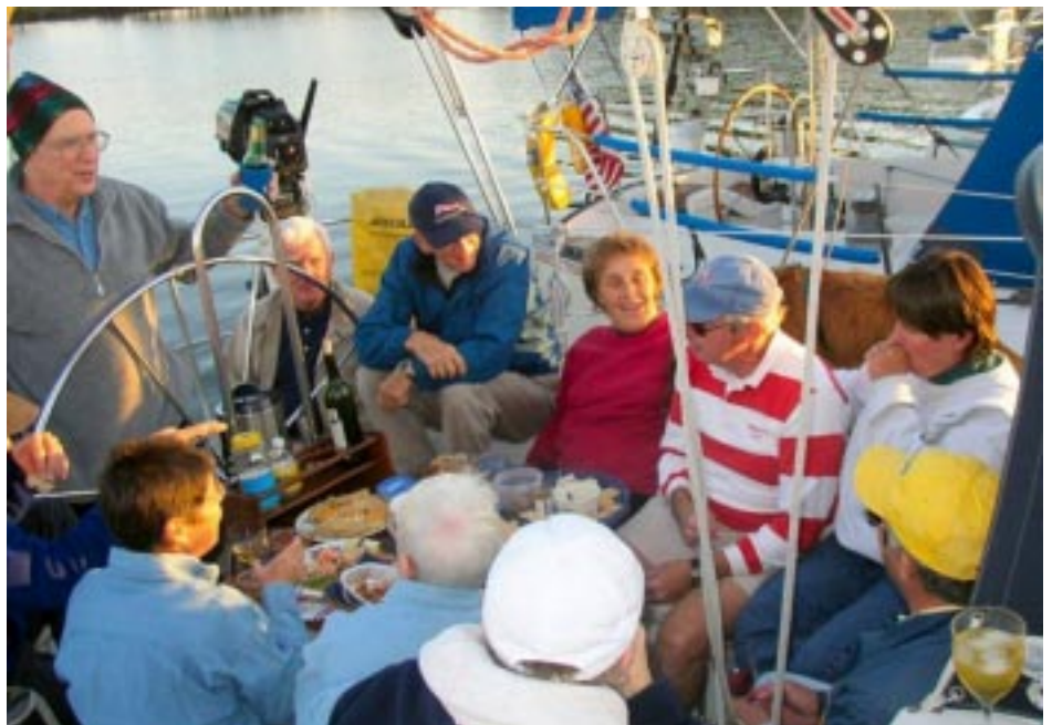
MRSA Goose Cruisers, .... Easily at Stage 2