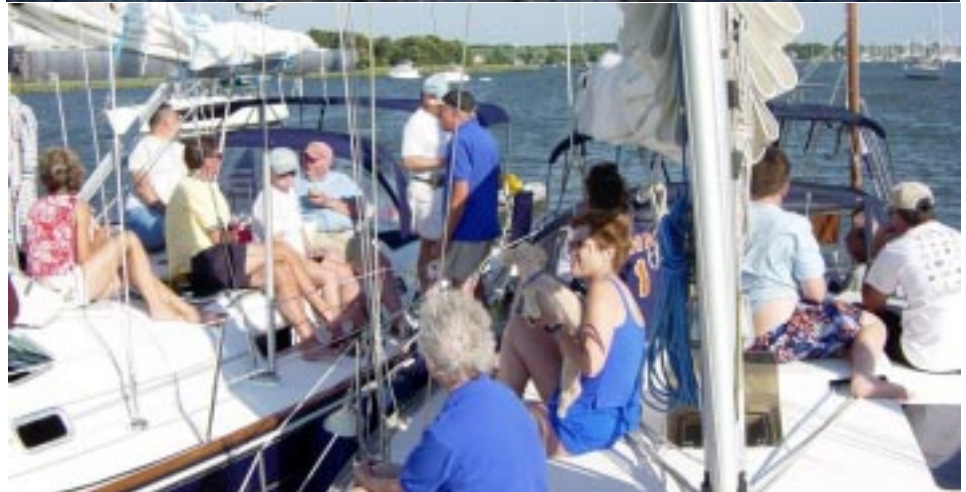
The Swan Creek Raft and Happy Hour Aboard Min Van IV and Flying Low