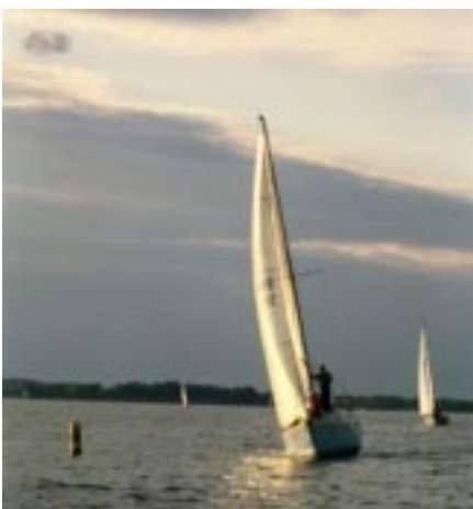
Some Great Wednesday Night Magothy River Racing Scenes