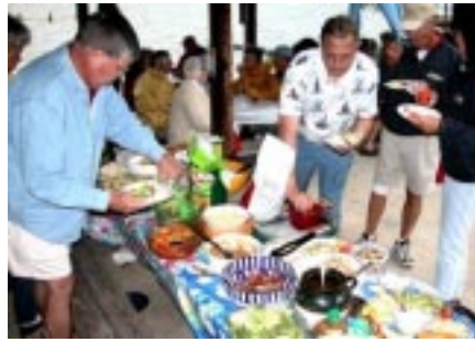
June Picnic .....