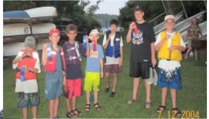
Junior Racers Show off their Award Ribbons