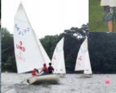
Monday Evening Junior Racers Approach the Mark