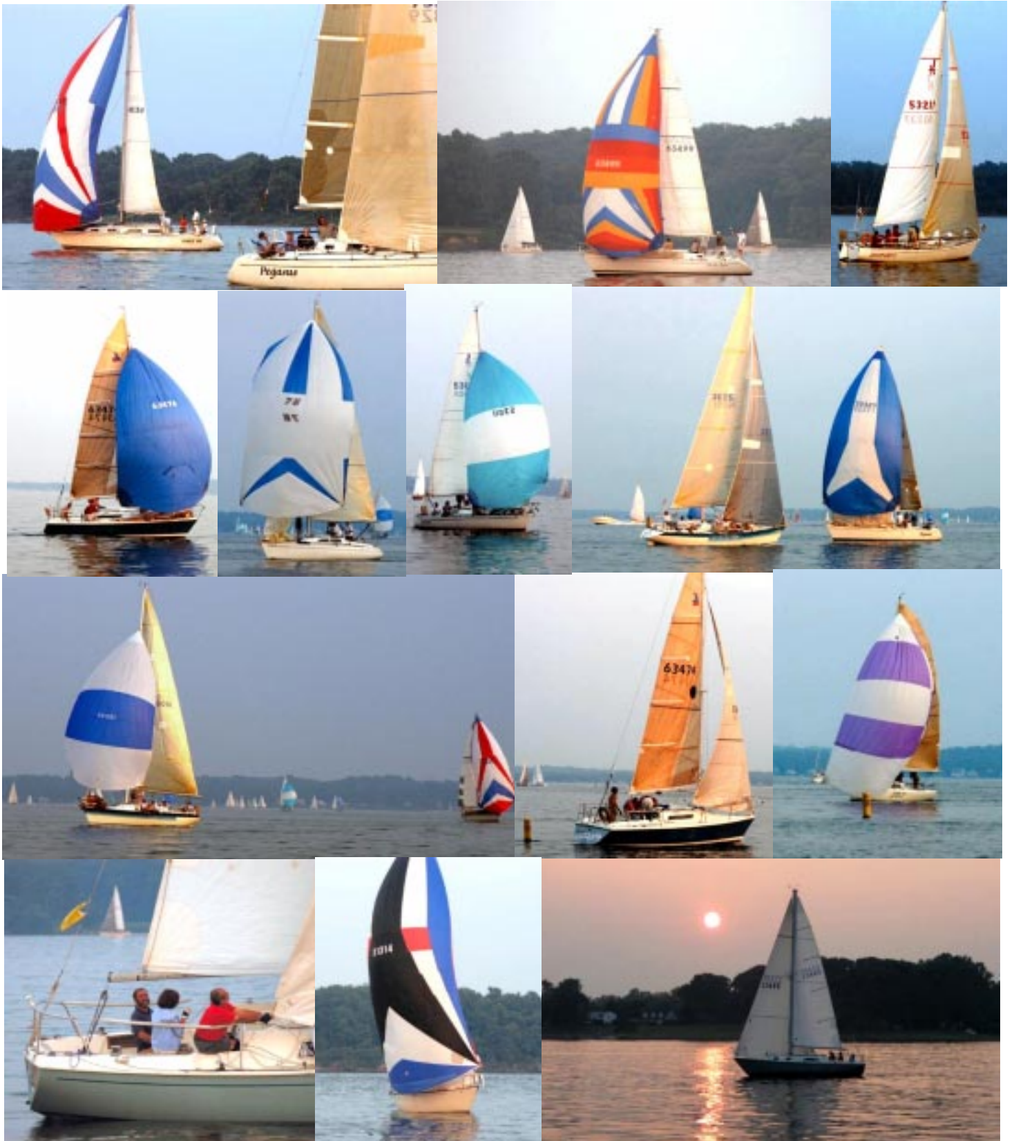
The End of Another Wednesday...