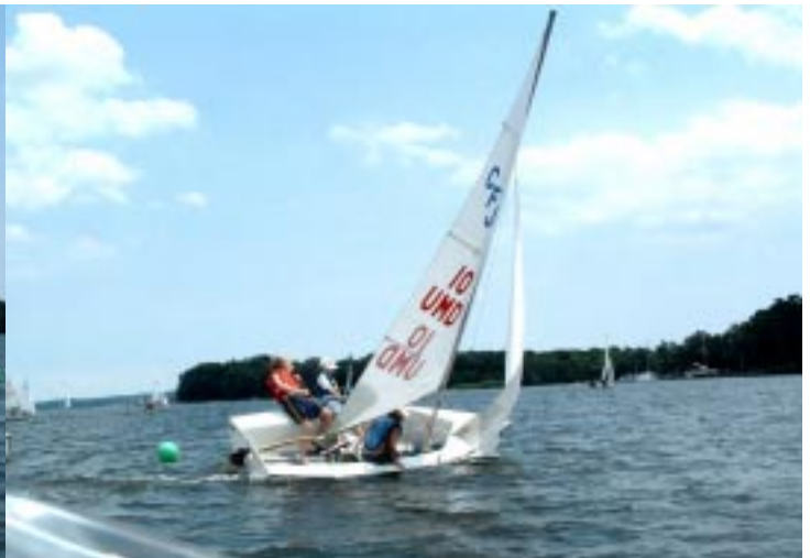
And an FJ Rounds the Mark