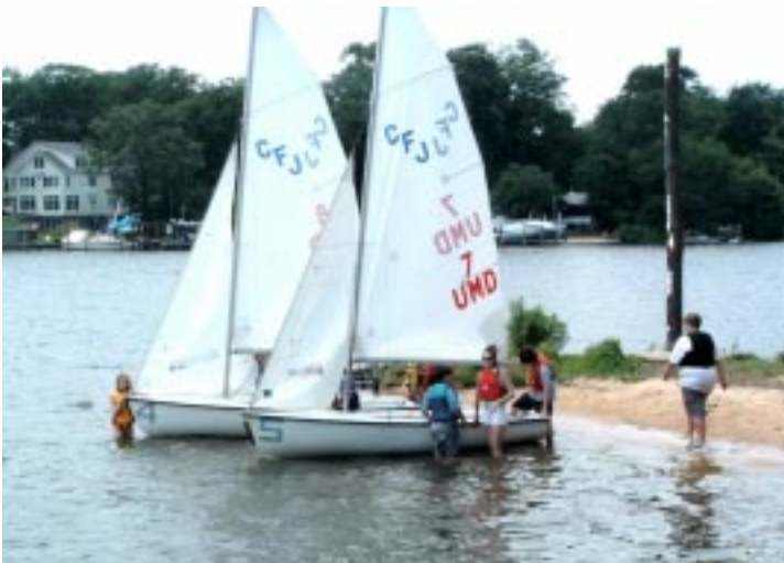
Getting a Pair of FJs Started Near the Totem Pole at Grachur Club Junior Sailing Camp