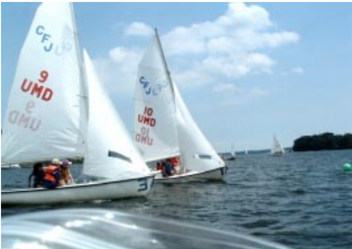
Junior Training FJs Approaching the Mark