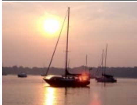
Sunrise over Quicksilver in the Rhode River