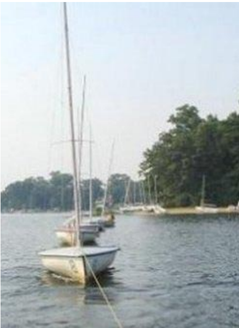
The Fleet is Towed to and from the Grachur Club